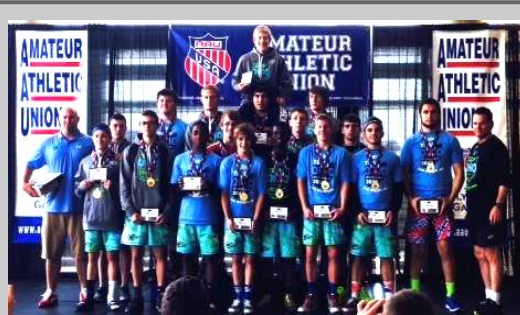
TEAM OHIO SCARLET 2014 National Champions